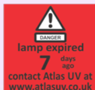
Lamp change warning