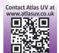
QR code screen