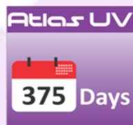
Lamp life remaining